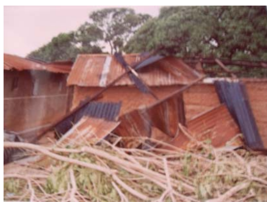
One of the houses destroyed by the storms Red Cross of Benin

<click here for the DREF budget , here for contact details, or here to view the map of the affected area>