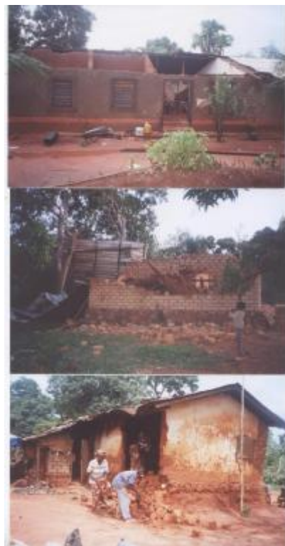
Houses destroyed by violent winds in Mbaïki

Summary: Since February 2009, heavy rains accompanied by violent winds and tornados have been hitting the Central African Republic (CAR) causing important damages. The disaster started in Bangui, the capital city, and extended to Berberati, Eastern CAR. Funds were allocated in February 2009 from the International Federation's DREF to assist 278 vulnerable families identified in the affected localities. On April 2009 new localities including Kembe, Grimari, Zangba, Mboki and Obo in Southern CAR, and Mbaïki located 110 km from Bangui, have also been hit by violent winds. Field assessments conducted by the respective CARCS local committees revealed that over 10,500 people have been affected. Several houses have been partially or completely destroyed; cooking utensils and other household property have been damaged. Some of the people affected have found refuge in relatives and well-wishers places. The most recent evaluation of the situation still show about 246 households that have been made homeless and currently looking for a place to stay, especially in the forest and in cracked and abandoned houses. These families therefore live under precarious conditions as they are exposed to respiratory diseases. The situation is likely to get worse if they are not urgently given non food items to enable them to regain their human dignity while waiting for substantial support for recovery.