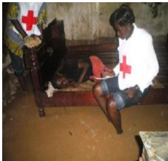
Red Cross volunteers assisting floods victims

<click here for the DREF budget, here for contact details, or here to view the map of the affected area>