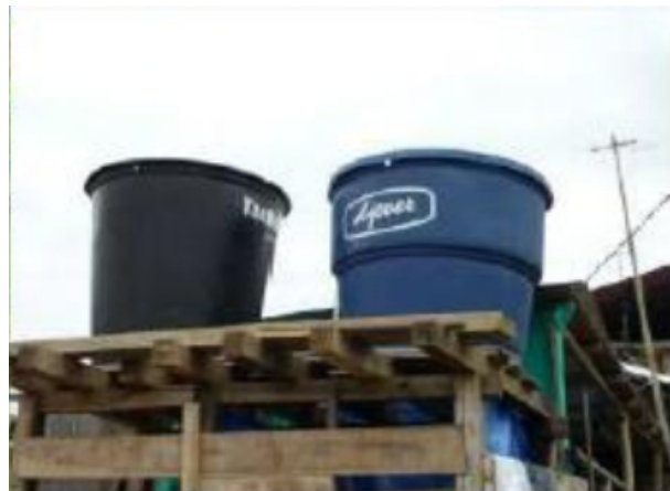
Water tanks were installed in homes of affected families.

After completing the initial damage and needs assessments and to complement the assistance provided by the government, the CRCS drew up an plan of action to assist 5,000 affected families in the department of Nariño. The plan of action included the distribution of basic non-food items (NFI), distribution of shelter kits, provision of safe water and basic health care and National Society capacity-building activities.