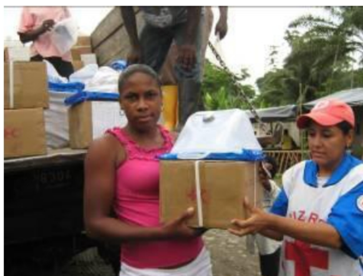
A beneficiary from Tumaco receives relief aid from Colombian Red Cross Society volunteers.

Summary: The department of Nariño was affected by two natural hazards during 2009: volcanic activity and floods due to heavy rain. On 16 February 2009, the Mira River in the municipality of Tumaco overflowed, severely affecting the residents in the south western department of Nariño in Colombia. The DREF support facilitated the initiation of the relief activities, but longer-term funding support was needed to sustain the relief operation. Based on the urgent situation, a preliminary Emergency Appeal was launched in response to a request from the Colombian Red Cross Society. This final report shows the activities carried out by the Colombian Red Cross Society which included the provision of non-food items and water and sanitation to 2,000 families. Health services were also provided through mobile units reaching approximately 1,267 people. An evaluation was conducted by a shelter delegate from the International Federation's Pan American Disaster Response Unit (PADRU) on the shelter kit that was provided.