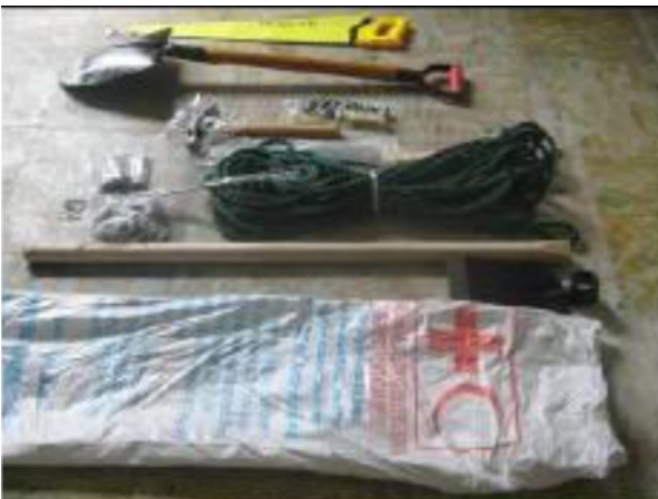
Tools included in the shelter kits distributed.

Since the beginning of the emergency, the Colombian Red Cross Society with support from the National System for Disaster Prevention and Response (Sistema Nacional para la Prevención y Atención de Desastres - SINAPRED) have been actively carrying out response actions to assist the most vulnerable families affected in the area. In addition, the CRCS activated its crisis room and monitored the progress of the activities to respond to the emergency from the outset. The CRCS has extensive experience in responding to emergencies of this nature and immediately activated its response mechanisms.