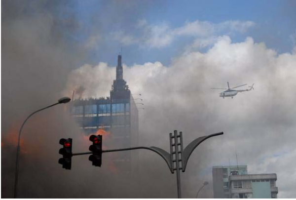
Surveillance by chopper