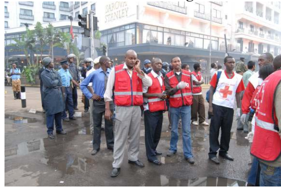
Coordination and networking