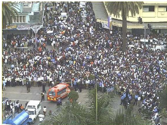
Scenes in Nairobi's Central Business Centre following a blast at Nakumatt Downtown Supermarket

In this incident, some 26 people were confirmed dead and efforts are continuing to determine the fate of 30 others reported missing.