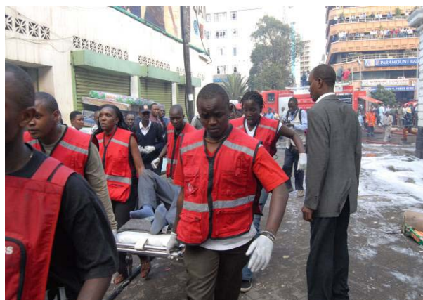
Kenya Red Cross Society staff and volunteers remove from the scene a victim of the Nakumatt Supermarket fire tragedy, in Nairobi.

<Click here for the DREF budget, here for contact details or here to view the map of the affected area >