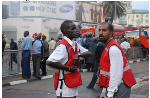
Planning next action