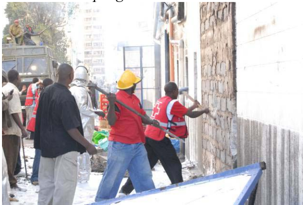
Extrication in progress