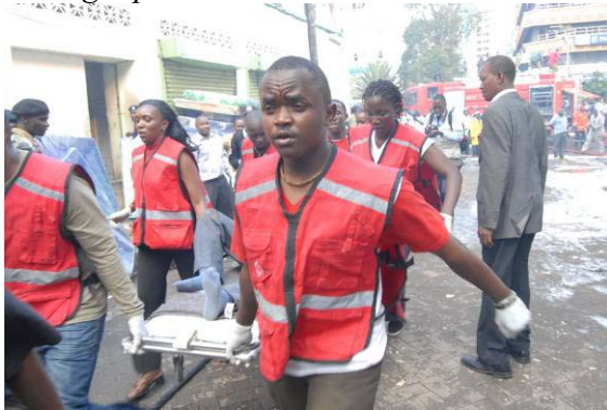
Taking a patient to the ambulance