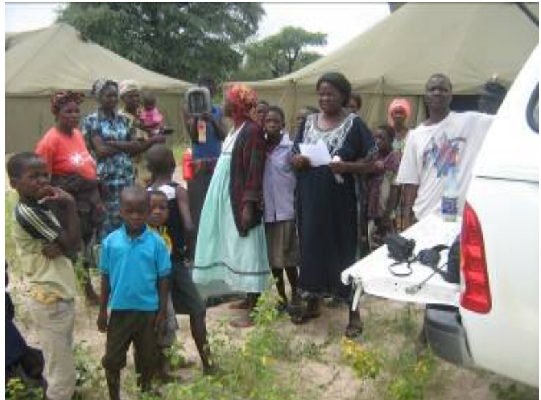
Relocation Camp in Ohangwena Region.

Long-term needs include improving and sustaining livelihood for families affected by crop damage, as well as reconstruction of destroyed houses.