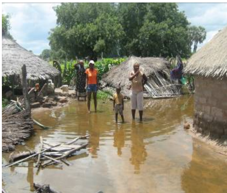
Household submerged in flooded water in Ohangwena Region.

effects and displacement of communities. In addition, the flooded Kunene region reported a cholera outbreak that has caused seven deaths so far.