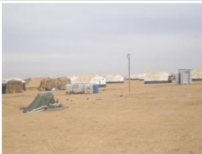
Flood IDPs camp in Richard Toll (shelter component)

Appeal coverage: 47%; <click here to go directly to the updated donor response report, or here to link to contact details> Cash donations for the appeal still needed to complete its objectives.