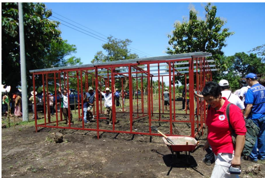
Community members contributed to the construction of temporary shelter, which empowered communities with skills to make housing repairs.

Through the coordination and capacity building achieved by the volunteers and personnel of the Salvadoran Red Cross Society it was possible to establish community groups (of 8 to 10 individuals) who participated in the project and received coaching to support the construction and repair works. Technicians of the company Plycem provided training on the plastering of structures to set up the internal and external walls using fibre cement. Community representatives and technical personnel of the project attended this demonstration session.