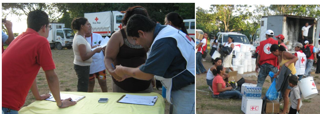
3,000 of the most vulnerable families in the affected departments of the San Vicente, La Paz, Cuscatlán and San Salvador received hygiene kit, blankets and kitchen kits distributed by the Red Cross volunteers.

The National Society designated a person responsible for the distribution in each distribution site. This person submitted a report, the distributions lists signed and stamped by the beneficiary families and community leaders to the SRCS relief director. All the information was consolidated afterwards. In addition, monitoring visits were conducted from the outset of the operation. These visits included the presence of the relief director, SRCS branch directors, the departments of internal and external auditing of the National Society and international donors including the IFRC, ECHO, the Finnish Red Cross, the German Red Cross, the Spanish Red Cross, the Swiss Red Cross and local donors such as Scotia Bank, Digicel and Indufoam. Two Regional Intervention Team members were present between November and December 2009 supporting the SRCS with the relief efforts and monitoring activities.