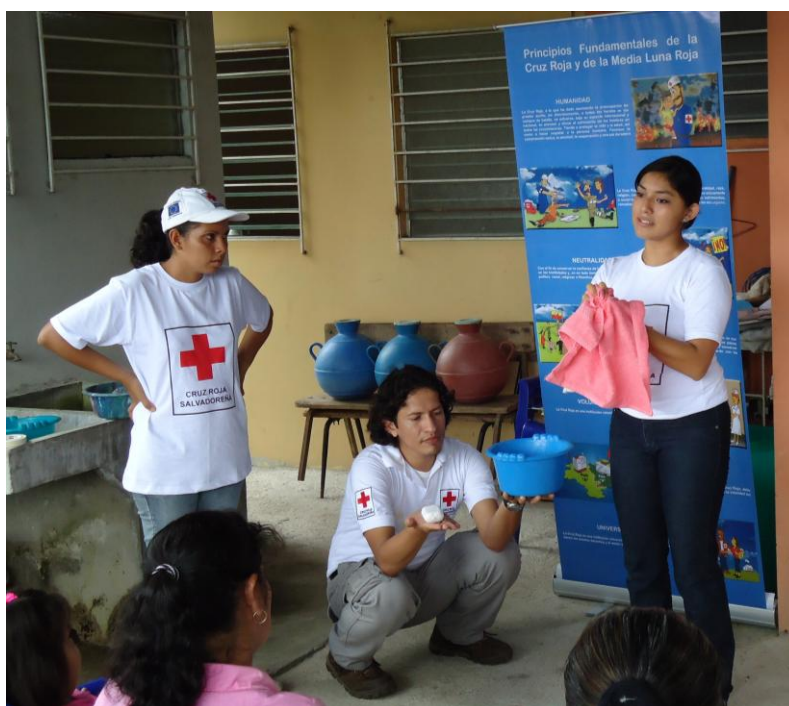
SRCS volunteers conduct a hygiene promotion talk for community leaders.

In relation to the third output under this component, hygiene promotion talks took place in different communities in coordination of the Ministry of Health and were targeted in particular at the local health committees, or water and sanitation committees, or in some cases the local community development associations (ADESCO: Asociaciones de Desallorro comunal). Each talk focused on the following topics: personal hygiene, household cleaning, food hygiene, water collection, transportation, storage and handling, prevention of water-borne diseases. 86 community members were trained in the hygiene promotion talks carried out in the following communities: