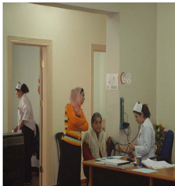
Jaramana is one of the 10 SARC clinics supported by the International Federation.

The International Federation of Red Cross and Red Crescent Societies has responded positively to a request by Syrian Arab Red Crescent (SARC) to continue supporting health services also in 2011. A work plan is currently being prepared to decide on the number of clinics to be included in a revised appeal for next year.