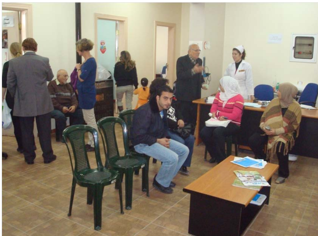
Jaramana is one of the clinics providing health awareness sessions to the patients.

Progress: To reinforce activities related to health awareness and community based health and first aid (CBHFA), a plan of action has been developed and a coordinator recruited responsible to support the clinics in improving measures towards preventive health and to integrate the clinic program with other activities carried out by SARC branches and volunteers, particularly community based health, hygiene promotion and safe water handling. As a first step, 22 volunteers, clinic staff and mobile health unit staff in the drought affected areas were trained on the International Federation CBHFA modules, This was the first time clinic staff and volunteers were given the opportunity of a joint training, and the feed back was very positive. This basic training will be followed by a train the trainer's course with the objective to ensure that each branch has at least 10-15 volunteers trained and ready to assist in community based health activities and to support the clinics with health awareness sessions.