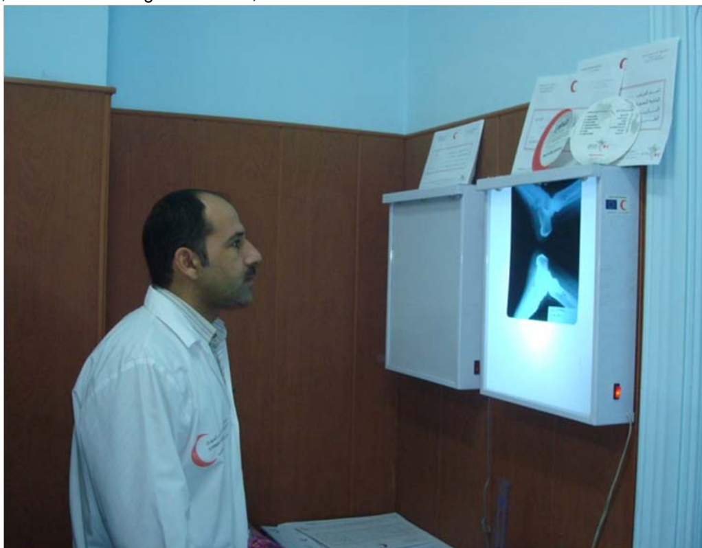
SARC clinics provide quality basic health care to Iraqi displaced and host communities.

Four mobile health units (MHUs) continued to be supported during the reporting period. The MHUs have increasingly extended their services to populations affected by the drought and their capacity was strengthened thanks to support also from the International Federation emergency appeal in response to the drought (MDRSY001). The four MHUs are operating out of rural Damascus, Homs, Deir al Zor and Qamishly. The coverage areas are vast, with small villages and settlements scattered in partly semi-arid or desert areas. A rapid evaluation of the services was carried out jointly by the International Federation and SARC earlier this year. The conclusions described a need to continue providing health services through the MHUs with a few amendments for improved services. The MHUs are reaching out to poor, rural communities with no or limited access to other health services. The main acute diseases for patients served by the MHUs were acute tonsillitis, gastritis, bacteria pneumonia, glycosuria, acute pharyngitis, dorsalgia, cough, other anaemias, status asthmaticus, elevated blood glucose level, and bronchiectasis. The main chronic diseases were hypertension,