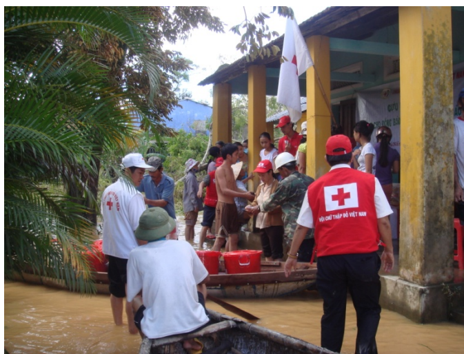
VNRC household kits which include cooking and kitchen utensils, blankets and water plastic containers were distributed to affected families in the province of Da Nang. VNRC Da Nang chapter.

Staff and volunteers from provincial branches in this disaster-prone area of Viet Nam have been trained in contingency planning, including evacuation, early warning, rescue and life saving as well as first aid. Thousands stood ready to help early Wednesday morning on 29 September, helping stranded people to safer houses and distributed instant noodles and water.