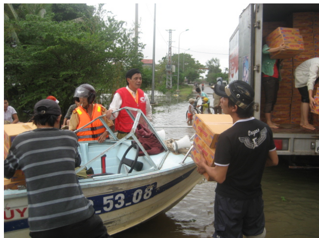
The VNRC Quang Binh chapter mobilized its pre-positioned stocks which include instant noodles and distributed them to affected families in the province. VNRC Quang Binh chapter.

Local governments have appealed to the central government for large scale support, including 24,100 tonnes of rice, 600 tonnes of rice seeds, 20 tonnes of vegetable seeds, 30 tonnes of maize seeds, and VND 678 billion (CHF 40 million USD 88.5 million) are requested. The central government have so far pledged 10,000 tonnes of rice (approximately 41 per cent of the estimated needed amount). In addition, the government health sector has provided 200 emergency health kits and up to five million water purification Chloramin B tablets to the typhoon/flood affected provinces.