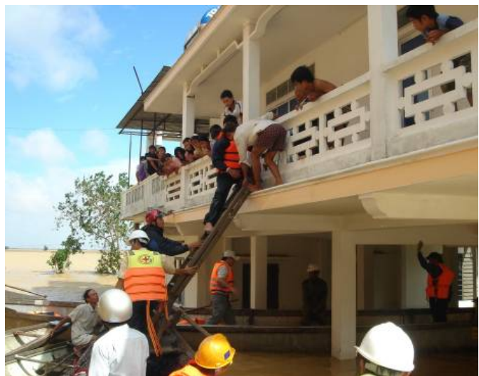
Viet Nam Red Cross quickly responded to the needs of the affected communities following the typhoon and floods, including in the province of Quang Tri.

<click here to view the attached Emergency Appeal Budget; here to link to a map of the affected areas; or here to view contact details>