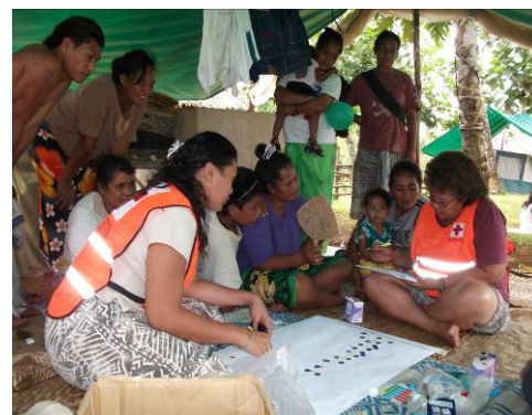
Samoa Red Cross Society's Health Coordinator and volunteers conduct social mapping with affected communities.

Social mapping of the rest of the villages will continue.