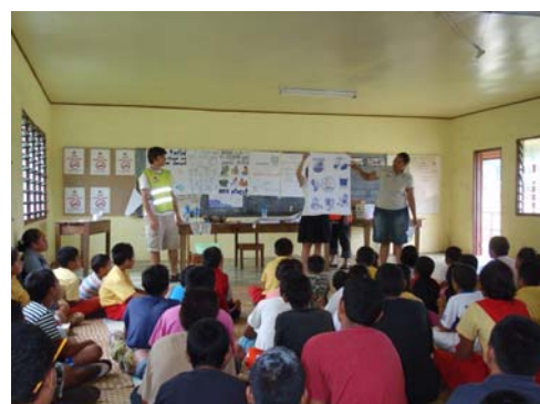
Samoa Red Cross Society's community-based health and first aid (CBHFA) volunteers disseminate hygiene promotion messages in Lalomanu School on how disease spreads and "hand washing".