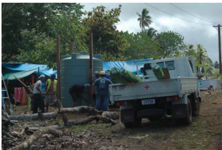
Samoa Red Cross Society volunteers build a shelter for a 3,000 litre communal water tank in Mutiatele.

This operation is to be implemented over an 18-month period and is expected to be completed by April 2011. A final report will be made available by July 2011, three months after the end of the operation.