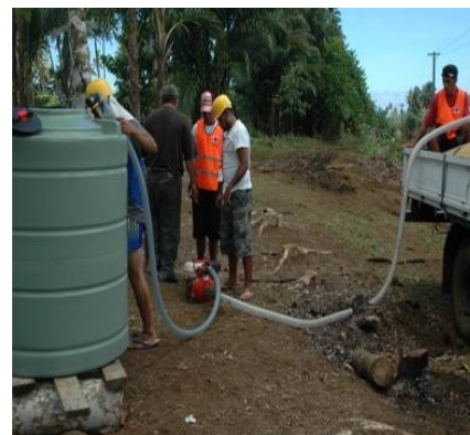
Water filling in Satalo.