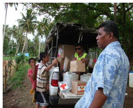
SRCS volunteers managing basic stocks.

The United Nations Disaster Assessment and Coordination team (UNDAC) departed Samoa on 9 October, handing over their previous responsibilities to United Nations Office for the Coordination of Humanitarian Affairs (UN OCHA). UN OCHA departed Samoa by the end of October, with the major coordination function being undertaken by the Samoan government.