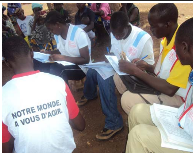
Identification of the most vulnerable beneficiaries to livelihoods revival support. BRCS/ IFRC

Summary: In July, August and September 2010, torrential rains caused extensive flooding in Burkina Faso, particularly in the provinces of Namentenga and Sanmatenga in the Centre-North region, Gnagna in the East, and Oudalan, Yagha, Seno and Soum in the Sahel. Given the scale of the disaster, 15 teams of 150 Red Cross volunteers led by the BRCS National Disaster Response Team (NDRT) conducted a detailed assessment of the situation in the affected provinces. The assessment carried out showed that 133,362 persons were affected by the floods; at least 2,500 families were without shelter. There was a significant immediate need for those families to acquire survival materials (non-food items) and adequate shelter, especially in areas difficult to access. The revival of livelihood opportunities was also a pressing need given the scale of the losses in subsistence homesteads and domestic livestock. Furthermore, hygiene promotion and improved access to water and sanitation remained critical for the overwhelming majority of persons affected by the floods. The results of the detailed assessment also revealed considerable damage to wells and hand-operated water pumps, as well as a widespread lack of sanitation. Based on detailed analysis of the needs and the vulnerability profiles of the persons who were recorded as being affected, an emergency appeal was launched.