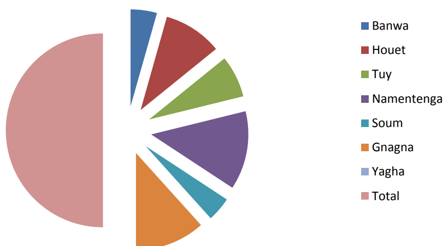
Beneficiaires of Income Generating Activities