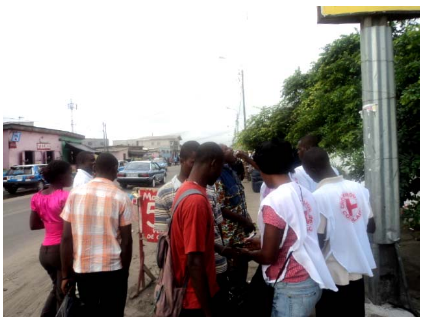
Congolese Red Cross volunteers facilitated the vaccination of people passing in the street: Photo: IFRC Central Africa Region

Summary: On 4 November 2010, the government confirmed the outbreak of wild poliovirus in the Republic of Congo. So far, the epidemic has already affected 434 people, killing about 180; i.e. an average lethality rate of 41 per cent. In order to support the Congolese Red Cross and government to respond to the epidemic, IFRC released some funds from its DREF and deployed its Central Africa Regional programme coordinator to cover the early hours of the disaster. Round 1 of the three anti-polio immunization rounds that were planned by government and its partners has now been completed. The timely intervention of Congolese Red Cross volunteers ensured 132 per cent vaccination coverage in Pointe Noire during part 1 of the first round of the campaign. Part 2 of this round in Brazzaville and the rest of the country started on 18 November to be completed on 24 November 2010. On day one of this part 2, 37.6 per cent of the people targeted were already vaccinated. So far, close to 500 Red Cross volunteers have been mobilized and are actually working for the operation.