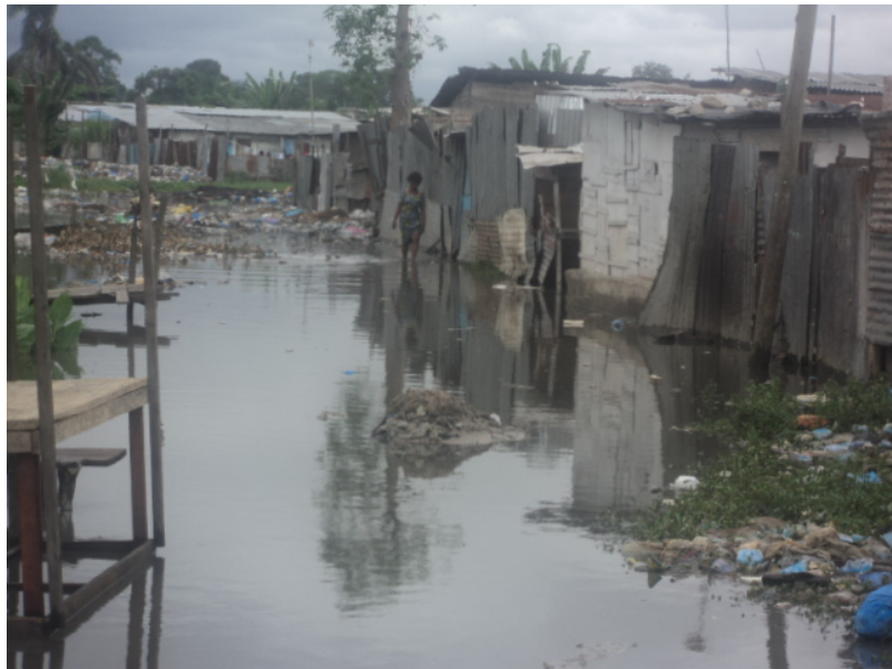
Area where most cases have been registered in subdivision 4 (Loandjili, Pointe Noire): Photo: IFRC Central Africa Region

After investigation, the Ministry of Health, WHO and UNICEF have concluded that the outbreak can be blamed on unhealthy environment, poor quality of water and the non respect of hygiene rules. In fact, the majority of the cases in Pointe-Noire come from the unhealthiest places of the city, mainly subdivisions 3 and 4. These same localities were the most affected by cholera in 2009. This picture gives an idea of where the population lives in subdivision 3 and 4.