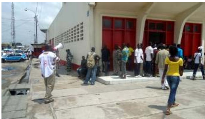
Red Cross volunteers sensitized the populations and encouraged them to get themselves vaccinated

Summary: On 4 November 2010, the government confirmed an outbreak of wild poliovirus in the Republic of Congo. So far, the epidemic has already affected 524 people, killing about 219; i.e. an average lethality rate of 42 per cent. To support the Congolese Red Cross and Government to respond to the epidemic, IFRC released some funds from its DREF and deployed its Central Africa regional programme coordinator to cover the early hours of the disaster.