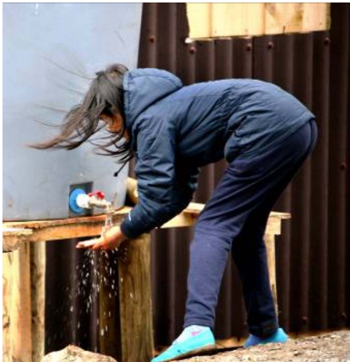
The polar front is affecting various countries in South America, amongst them Chile. In Coliumo, the freezing temperatures are exacerbated by the prevailing winds in the area.

The increase in prices is further complicated by the gradual impoverishment of the most vulnerable sectors of the population over recent years. In July, the results from a national survey on socio-economic conditions (Encuesta de Caracterización Socio-Económica - CASEN) were made public. This study, which is the primary instrument for setting social welfare policy in Chile, provides information on the socio-economic conditions of the various social sectors throughout the country, as well as the distribution and make-up of household income. The survey was carried in 2009 and the results show an increase in the level of poverty for the first time since 1990. An estimated 15.1% of the population (approximately 2,564,000 people) has been classified as 'poor' in 2009, compared to 13.7 % in 2006. This represents an increase of 1.4% - or 355,500 newly-impoorished individuals since 2006. Similar results were shown regarding levels of 'indigence' or 'extreme poverty'. In 2006, some 3.2% of the population was classified as being in 'extreme poverty', while in 2009 this figure had increased to 3.7%, representing approximately 634,320 people.