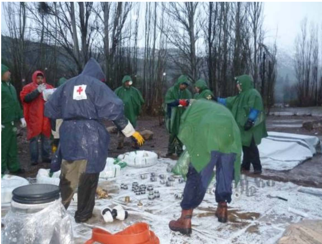
Familiarisation with equipment for water treatment plants, during Chilean Red Cross RIT training.

Hygiene promotion activities to complement the distribution of sanitation modules will be carried out in Dichato, Coliumo, Tumbes and Llico in Bio Bío region. These activities will focus on the prevention of illnesses related to the conditions in camps, such as overcrowding and difficulty of access to sanitary services. The water and sanitation team relies on a team of 25 local volunteers, who have experience of awareness-raising campaigns, and are conducting community education and door-to-door visits. Community members are being trained in basic hygiene practices, such as hand washing, waste disposal and personal hygiene, amongst other.