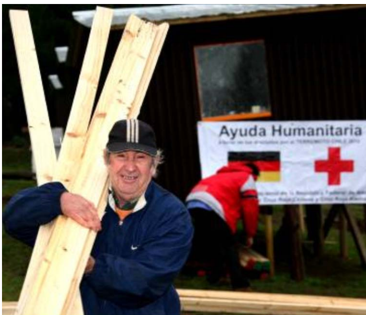
A beneficiary receiving a construction kit heads towards home. Each kit includes 10 zinc sheets, 2 kg of nails, a saw, a hammer and 24 wooden planks.

Another challenge is to reach those families not yet assisted – in this regard, activities will focus on rural areas in the O'Higgins region.