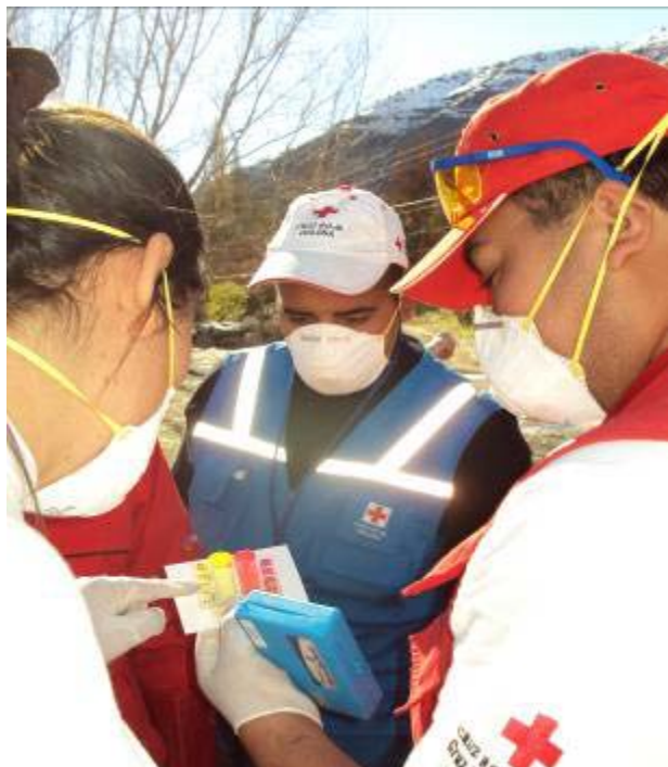
Chilean Red Cross volunteers undertaking water purification exercises under the supervision of instructors during National Intervention Team training in water and sanitation.