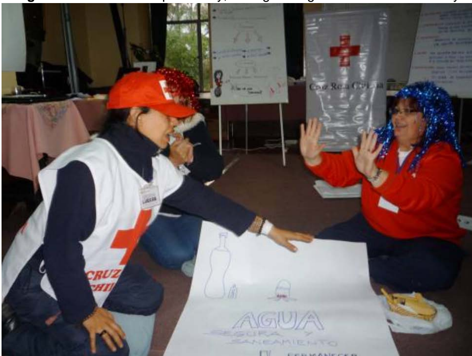
Training session of the Chilean Red Cross National Intervention Team in Water, sanitation and hygiene promotion.

Progress: As mentioned previously, strengthening of the National Society has become one of the key overall