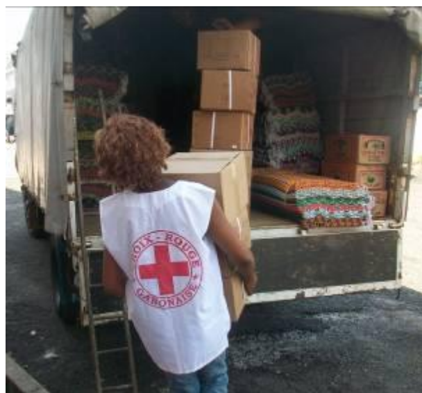
Non-food items were distributed to people affected by violent wind in Mouila / Gabonese Red Cross

This DREF allocation enabled the Gabonese Red Cross Society to distribute non-food items such as 460 tarpaulins, 230 cooking kits, 460 insecticide-treated nets (ITN), 2,070 pieces of soap and 460 mats to 230 families, i.e. precisely 1,442 people identified as the most vulnerable following the disaster. This distribution contributed to preventing the appearance of opportunistic diseases such as respiratory infections and malaria in violent wind victims. Red Cross volunteers also conducted a clean-up campaign in Mouila to help prevent recurrent floods in the town.