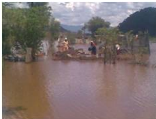
Displaced households salvaging the remains of their households items after floods pounded Naivasha area of Rift valley Province in Kenya.

<click here for the DREF budget, here for contact details or here to view the map of the affected area>