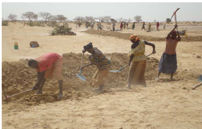
Beneficiaries rehabilitate land at Cash for work project site, Tahoua, Niger

Niger is one of Africa’s poorest nations. Perched on the southern edge of the Sahara, it has suffered cyclical drought for centuries, a phenomenon exacerbated by exploding population growth. The country is characterized by a trend in both number of disasters and the number of people they affected. The trends include climate change with an increase of floods, predominantly triggered by climatic hazard. These floods increase the vulnerability of many families that are already victims of drought, hunger and endemic diseases. In February 2011, the political stalemate in Libya worsened Niger’s situation already characterized by a socioeconomic poverty. Thousands of Nigeriens mostly young men fleeing violence in Libya crossed the borders into Niger. The International Federation launched a DREF to support