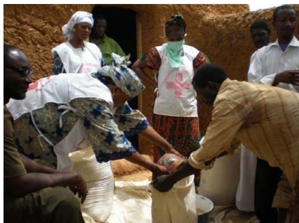
Distribution of improved seeds in Niger.

Summary: As a result of failed rains in early 2010, the population of Niger suffered from food shortages and a resulting nutritional crisis that hit children under 5 and left some 3.3 million people severely food insecure. When the full extent of the crisis was known, the original emergency appeal for CHF 986,862 was extended in scale (to CHF 3.65 million) and duration (until June 2011). The Red Cross Society of Niger (RCSN), with support from the International Federation emergency appeal implemented disaster response in three of the eight regions in the country, targeting recuperation of eroded lands through the Cash for Work programme, reinforcement of farming activities through distribution of free improved seeds for households, coordination of essential nutrition activities, and food distribution with WFP. This includes the distribution of 65.46 tonnes of local improved millet and cowpea seed to 4,364 households, i.e. 30,558 people. Food distribution ultimately reached 82 villages and 2,657