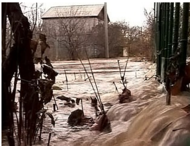
Flooding in Novoanninskiy district of Volgograd region.

<click here for the DREF budget, here for contact details, or here to view the map of the affected area>