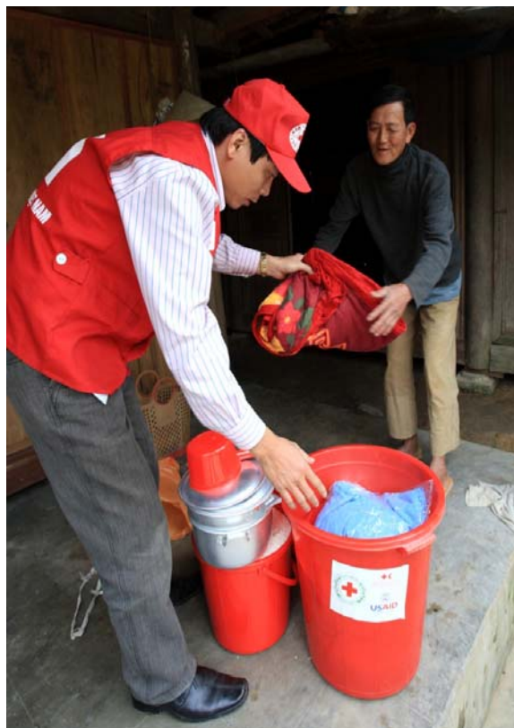
A staff member of Ha Tinh Red Cross chapter checks the contents of a household kit with the head of a family in the Phu Phong commune, Huong Khe district, Ha Tinh province.

The VNRC disaster response operation has been extended to cover Nghe An province as the people in Nghe An were badly affected by the first flood and affected even worse by the second in October.