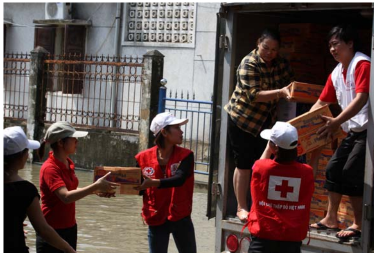
Red Cross staff and volunteers in Nghe An province delivered emergency relief to flood affected people.

The distribution of 120 tonnes were supported through contributions to this emergency appeal was completed from 1 to 6 November 2010 (see Annex Two for details ). Distribution was made according to IFRC standards and procedures. Up to 4,000 families with approximately 18,418 people were the first recipients of food aid from this emergency appeal. All recipients interviewed have expressed their appreciation of the timeliness with which rice was distributed by VNRC i.e. within 15 days after the launch of the emergency appeal as reported in the second operation update .