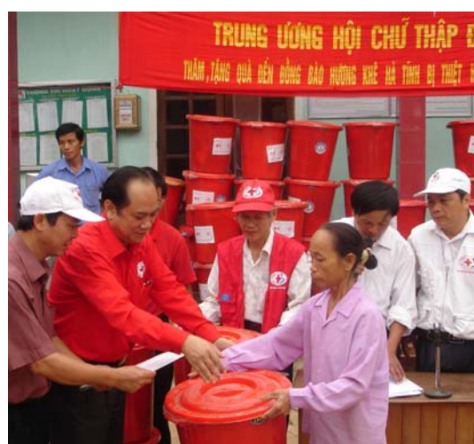
In Phu Phong commune, Huong Khe district, Ha Tinh province, this 54-year-old head of family who lost her house, received a household kit in October 2010.

One of the key lessons learnt during the 2009-2010 cash grants distribution (under the Typhoon Ketsana operation) by VNRC was the importance and role of volunteers (in monitoring and supervision) for such distributions and the urgent need for VNRC to build the knowledge and skills capacity of its staff in this area. The staff and volunteers in the three provinces will therefore receive further training on cash distribution guidelines of the Red Cross Red Crescent Movement and lessons highlighted from the Ketsana operation will be reiterated during this training.