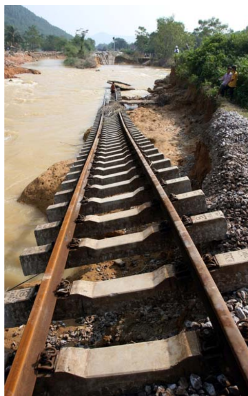
National railways badly damaged by the consecutive floods in Ha Tinh province

Under this emergency appeal, VNRC staff and volunteers have distributed 120 tonnes of rice in provinces of Ha Tinh and Quang Binh and cash-for-food to buy 432 tonnes of rice in the three provinces of Nghe An, Ha Tinh and Quang Binh. VNRC also distributed 3,500 household kits and 3,000 boxes of water purification tablets in