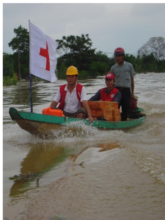
VNRC was one of first organizations to provide emergency relief in Quang Binh.

VNRC also distributed 3,500 household kits and 5,800 boxes of water purification tablets to an equal number of