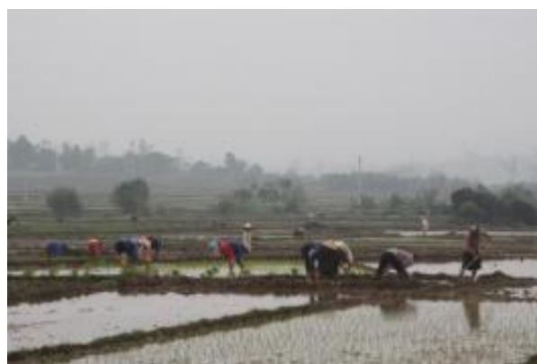
Farmers started the rice planting in February in Nghe An province for the spring/summer crop.

As such, the staff and volunteers of 46 selected communities in the three provinces received further training on cash distribution guidelines of the Red Cross Red Crescent Movement and lessons highlighted from the previous year's Typhoon Ketsana operation in order to improve their monitoring of the cash grant distributions.