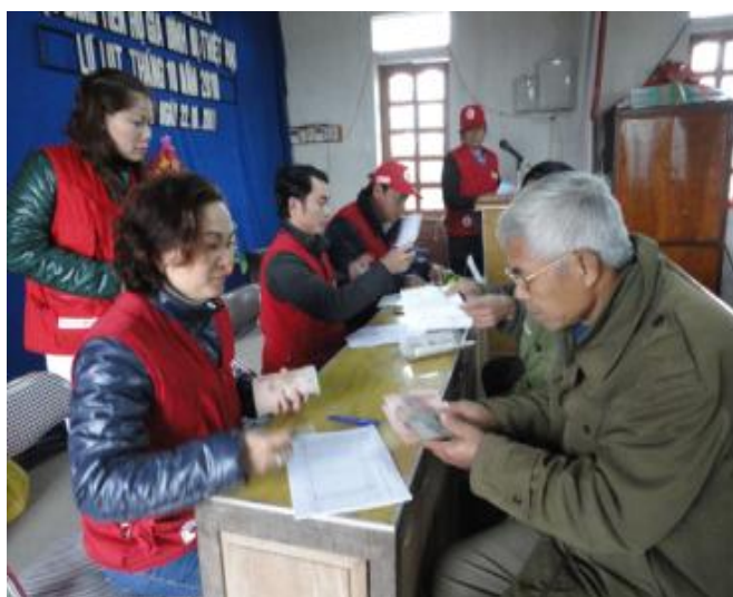
21 January 2011, Red Cross staff and volunteers in Nghe An province distributed cash for food to selected people in Thack Khai commune.

From 1 to 6 November 2010, the distribution of 120 tonnes of rice supported through contributions to this emergency appeal was completed ( see annex three ). Distribution was made according to IFRC standards and procedures. Up to 4,000 households with approximately 18,418 people were the first recipients of food aid from this emergency appeal. Also, 3,300 households with approximately 12,000 people in Ha Tinh and Quang Binh received 99 tonnes of rice with transport and distribution cost covered by this emergency appeal. All recipients interviewed expressed appreciation of the timeliness with which rice was distributed by VNRC within 15 days after the launch of the emergency appeal.