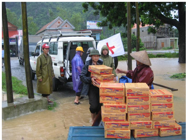
VNRC volunteers preparing for the distribution of instant noodles to people affected by the flood in Quang Binh province on 5 October 2010

VNRC chapters have been particularly active since the onset of disaster by distributing household kits comprising blankets, mosquito nets, kitchen utensils and water containers, as well as cash and plastic sheets.