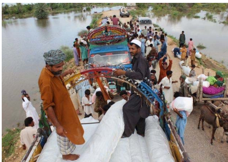
Relief distributions are taking place in Khairpur district, a district that was also badly affected by the floods in 2010.