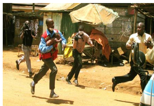
URCS volunteers in Wakiso District rescuing a baby from tear gas during the walk to work riots.

Uganda Red Cross Society staff and volunteers delivered assistance during a "walk to work" protest campaign organized by opposition politicians against escalating food and fuel prices that had resulted in riots in urban centres across the country. During the five weeks of protest, URCS responded to 498 reported violent incidents, referred 306 people to hospital for further treatment and dealt with 11 deaths. Those assisted were affected by injuries/wounds caused by beatings, stampedes and confrontation with security agencies, tear gas, live gunshot wounds and rubber bullets. URCS provided First Aid services, psychosocial support to people affected by violence and tracing services. In addition, the National Society gathered and disseminated information while providing daily updates on the number and types of incidents responded to.