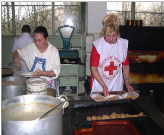
During the cold winter, Red Cross soup kitchens are often the only option for hot meals for Moldova's most vulnerable elderly people

In Moldova: The National Society developed its disaster management capacity through purchasing of bed linen sets and designing a disaster preparedness/response plan. Moldova Red Cross will assess the level of vulnerability in Moldova and disaster management potential, with an eventual aim to better understand how to mitigate potential risks. To ensure effective analysis of the in - country situation, Moldova Red Cross staff have been trained in Vulnerability and Capacity Assessment (VCA) methodology. The National Society is also working in close cooperation with the Ministry of Emergencies to collect hazard risk data.