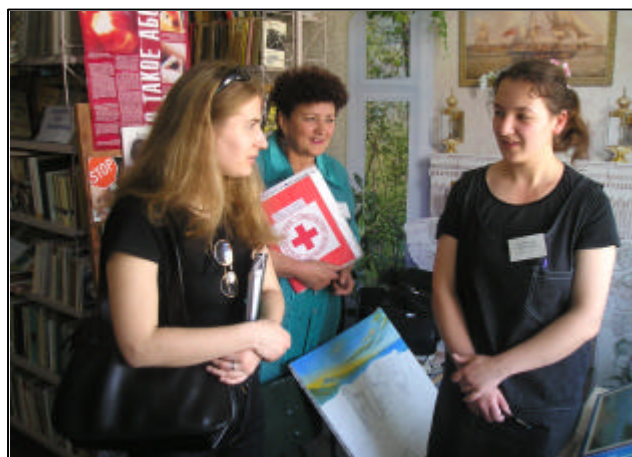
Ukrainian Red Cross is the only humanitarian organisation providing information on HIV/AIDS to young detainees

In Ukraine: Youth peer educators are fully committed to fight HIV/AIDS epidemics in the country and their communities. Through their peer education sessions and systematic information campaigns, the general public/target audience is exposed to appropriate messages to encourage behaviour change. At the same time, the peer education project offers young people (both peer educators and beneficiaries) the opportunity to assume responsibility for their health and their future.