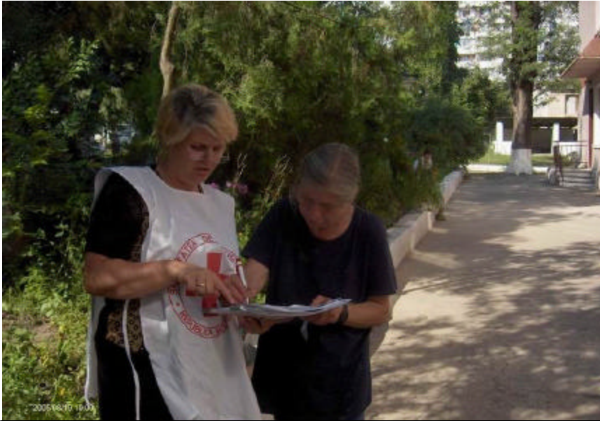
Moldova Red Cross volunteer is conducting a Vulnerability and Capacity Assessment of communities in most disaster prone areas.

NS has also initiated a dialog with the Emergency Department of Internal Ministry regarding the role of Moldova Red Cross in the National DP/DR plans and development of the Collaboration Agreement.