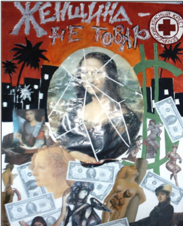
One of the winning posters of the drawing competition among youth reads: Woman is not a commodity.

Owing to funds from the IOM 5 , since the beginning of 2005 Belarus Red Cross has been actively involved in anti-trafficking activities. In all five regional capitals of Belarus (Brest, Grodno, Vitebsk, Mogilev and Gomel) consultation centres “Hands of Help” were opened on the basis of medico-social centres. Since September 2005, owing to the funds from Swedish Red Cross, the joint activities of BRC and the IOM has been supplemented and strengthened by production of various printing materials and employment of legal advisers and psychologists in all five consulting centres.