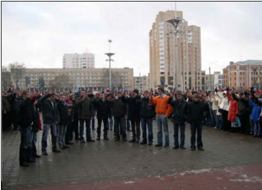
Through the Candle Light March organised in Minsk on 1 December Belarus Red Cross for the first time publicly declared itself as a national player in fight with HIV/AIDS.

A highlight of this reporting period has been the World AIDS Day on 1 December 2005, a special event widely celebrated by the Belarus Red Cross society. The first celebration in the history of the national society has ultimately raised its profile and served as a platform to promote various RC programmes, ranging