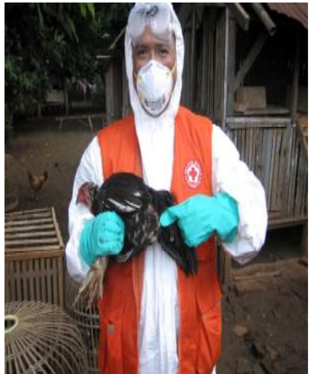
A volunteer from Indonesian Red Cross or Palang Merah Indonesia (PMI) disinfecting poultry farms with identified risks of Avian Influenza outbreaks. International Federation.

In a world of global challenges, continued poverty, inequity, and increasing vulnerability to disasters and disease, the International Federation with its global network, works to accomplish its Global Agenda, partnering with local community and civil society to prevent and alleviate human suffering from disasters, diseases and public health emergencies.