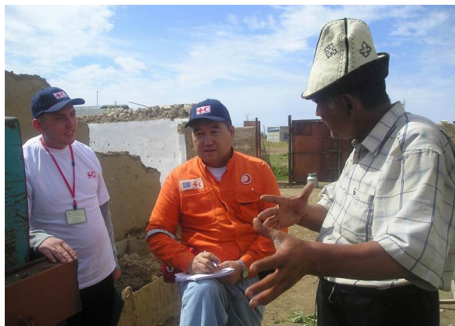
DRT competition: realistic assessment of community capacities is important when planning response operations

During the regional planning meeting that took place in June, National Society DM coordinators discussed DM global meeting's outcomes and regional activities in 2006, and reviewed and detailed programme plans for 2007. Also, inter-regional experiences were shared, namely the RDRT lessons learnt workshop in Sri Lanka and its outcomes, and international RDRT training in Macedonia.