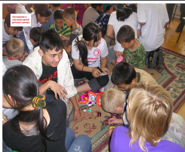
Peer to peer: Red Crescent volunteers give a helping hand to children from troubled families

Expected Result 4: Capacity of the Central Asia National Societies' youth movement to work with vulnerable populations has strengthened.