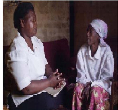
A Zimbabwe Red Cross Society care facilitator counselling a client.

In a world of global challenges, continued poverty, inequity, and increasing vulnerability to disasters and disease, the International Federation with its global network, works to accomplish its Global Agenda, partnering with local community and civil society to prevent and alleviate human suffering from disasters, diseases and public health emergencies.