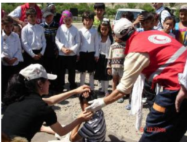
Simulation exercises for the Dushanbe city branch DRT.

Outcome: The disaster management capacity of the Red Crescent Society addressing the most urgent situations of vulnerability increased through effective disaster management strategies, policies and contingency planning at national and branch levels.