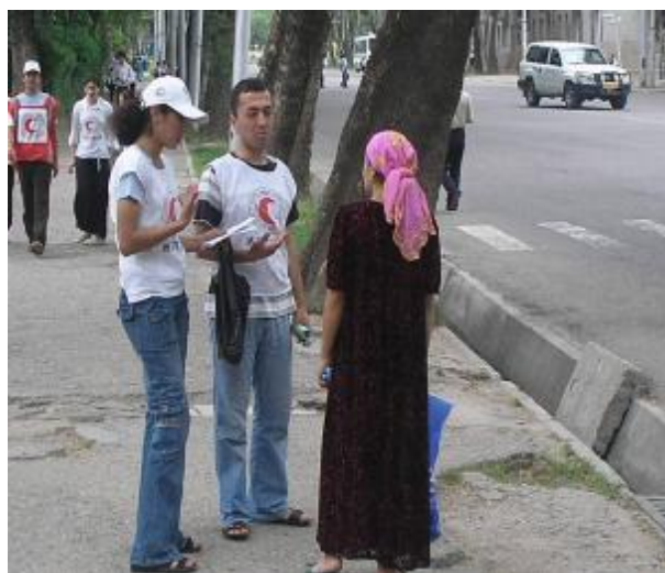
The Red Crescent awareness campaign on 8 May was held in the streets of Dushanbe.

This report covers the period 1 January 2008 to 30 June 2008