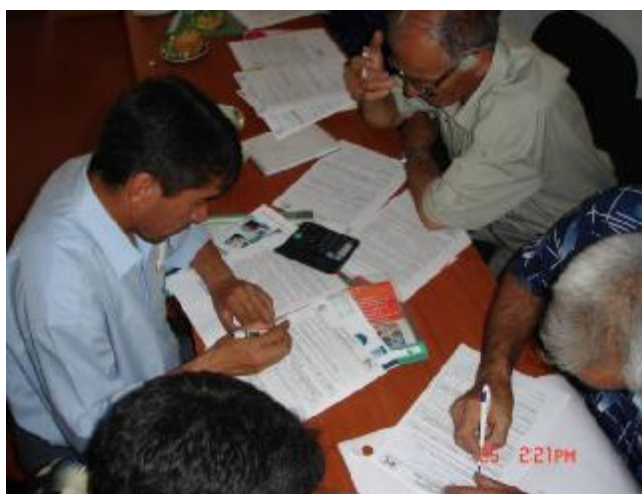
The members of newly established LDCs are studying the situation assessment forms during ToT in Rasht.

(ToT) sessions in disaster preparedness, disaster response and first-aid techniques. The strength of this approach is that they will be training their village mates. The average expected population benefiting from community-based disaster preparedness activities in the above areas is 24,800 people a year.