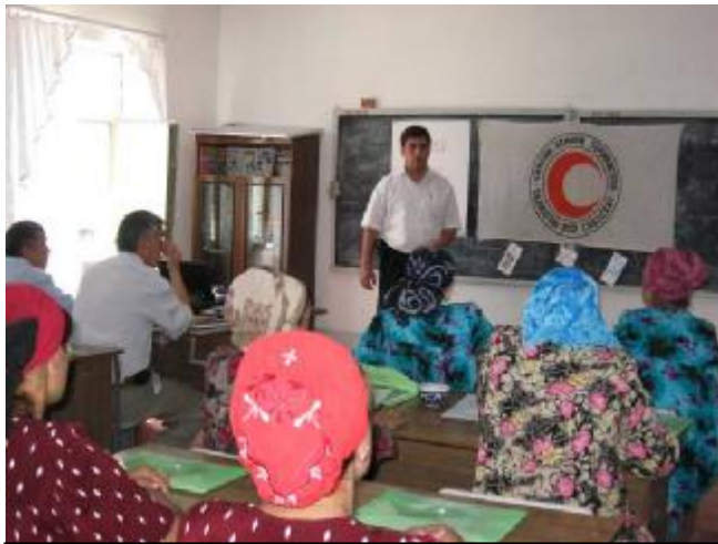
PHAST training in J.Ergashev village, Mastcho district.

The participatory hygiene and sanitation transformation (PHAST) trainings were held in 10 out of the 17 villages targeted for this year in Direct Rule Districts (DRDs) and Sughd province. Some 103 volunteers from the community representing various strata of the society, such as schoolteachers, doctors, housewives and local officials were trained. They started transferring the knowledge of sanitary-hygiene practices to their village fellows in early July. These trainings will be followed by an assessment of all 10 villages to select those most in need and meeting the selection criteria of having a high infectious disease rate and number of inhabitants, for further spring water supply systems construction projects in the second half of this