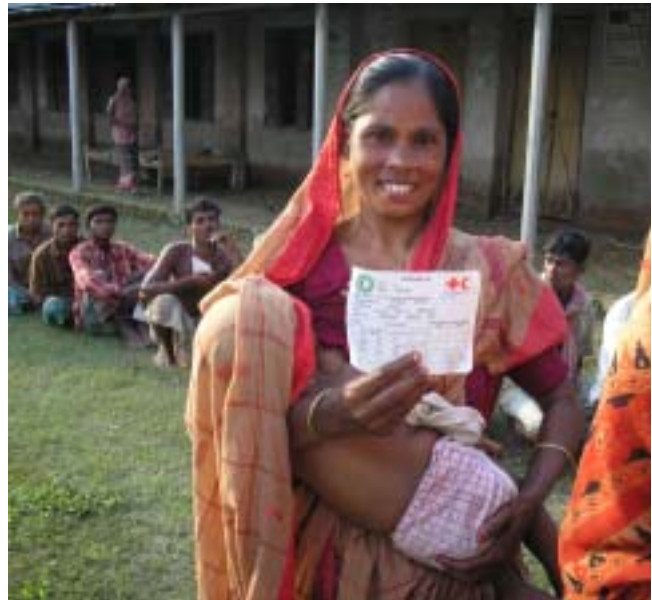
A mother at a relief distribution site shows her BDRCS / Federation relief distribution card.

In a world of global challenges, continued poverty, inequity, and increasing vulnerability to disasters and disease, the International Federation with its global network, works to accomplish its Global Agenda, partnering with local community and civil society to prevent and alleviate human suffering from disasters, diseases and public health emergencies.