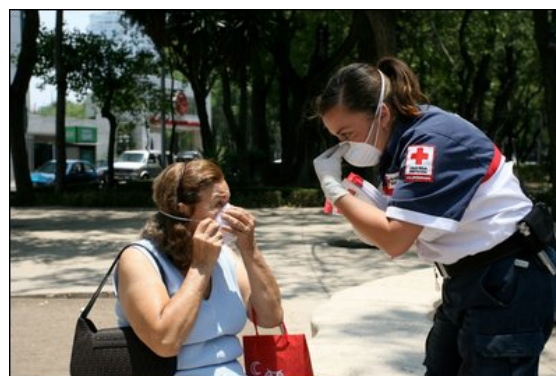
A volunteer of the Mexican Red Cross demonstrates the correct way to wear a mask as a preventive measure against the H1N1 virus and explains its importance in this regard.

This report covers the period 1 January to 30 June 2009