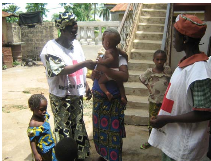
Nigerian Red Cross volunteers continuously participate in national efforts to 'Kick Polio Out of Africa!'

received funds from the Global Initiative to participate in both the January and May national immunization plus days against polio. Additionally, NRCS mobilized local resources directly from the UNICEF country office to participate in the national round in March. Nigeria, as the only polio endemic country in Africa (i.e. to have never interrupted WPV transmission), is a priority for polio eradication. With the largest number of polio cases coming from the country, regional efforts to stop transmission will only be successful if Nigeria eradicates the virus. NRCS has been a prime partner in national social mobilization and communication activities to increase the quality and coverage of polio vaccination campaigns. As a member of the Inter-Agency Coordinating Committee and the National Social Mobilization Working Group, the NS uses its mothers club and school unit strategies to resolve non-compliant cases by disseminating accurate information on safe polio vaccination at the household level.