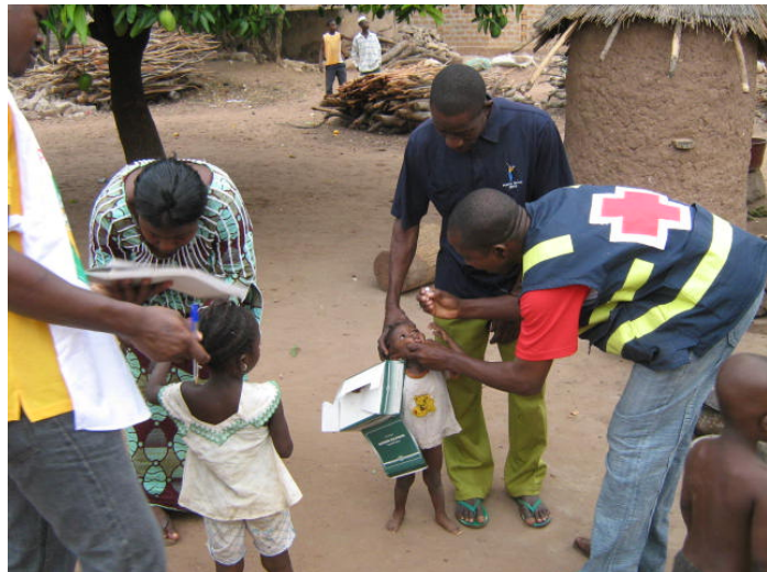
Burkinabe Red Cross volunteers vaccinate children against polio as part of the historic West Africa synchronised campaign.

Burkinabe Red Cross Society mobilized 530 volunteers and supervisors in 22 provincial communities during the March (27-30 March) synchronized polio round. Support provided by the Global Initiative (with the Swedish Red Cross as back donor) enabled volunteers to reach over 815,000 parents through door-to-door household visits, and organize more than 6,800 community focus group discussions that sensitized approximately 158,000 people to the importance of vaccination against polio. The March round had an administrative vaccination coverage rate of approximately 109 per cent (as opposed to the February round of 106 per cent).