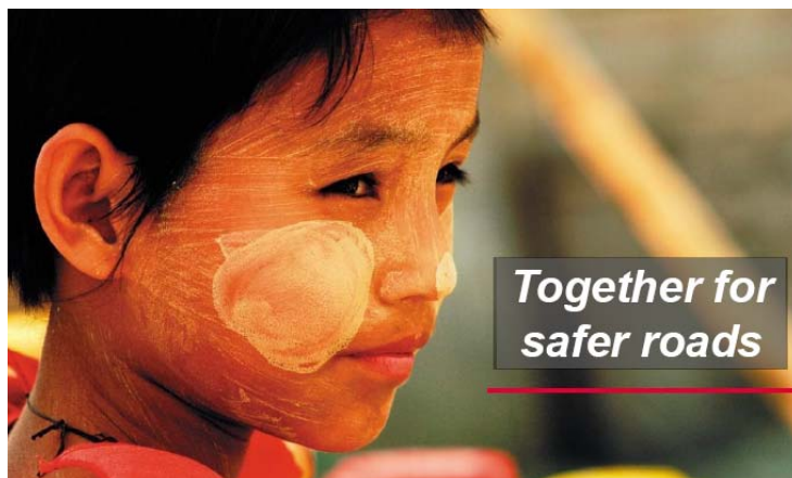
Awareness raising material on road safety, prepared under the programme. International Federation

This report covers the period 01 January to 30 June 2009