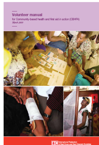
The new CBHFA volunteer manual with a module on road safety

The new Community based health and first aid in action manual, development of which was completed during this reporting period, includes a module on road safety. The manual is ready to be used by volunteers and facilitators. The manual can be seen at: http://www.ifrc.org/what/health/firstaid/tools.asp . Road safety has also been incorporated in the International Federation's draft