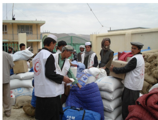
In April 2011, the Afghan Red Crescent Society (ARCS) distributed urgently needed materials after landslides in Marmol district of Balkh province, northern Afghanistan.