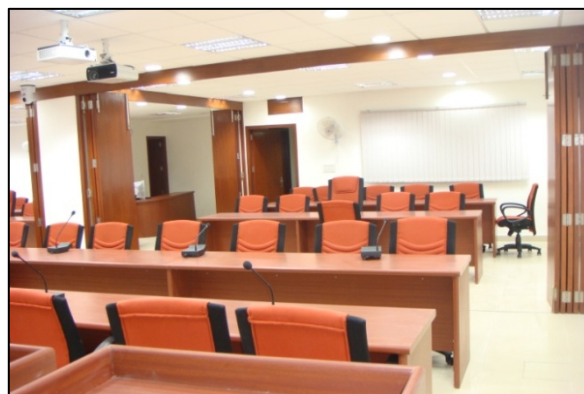
Multipurpose video Conferencing facility at Indian Red Cross Society national headquarters.

The video conferencing facility at IRCS national headquarters has been inaugurated by the Chairman of IRCS. The facility is aimed to connect the IRCS national headquarters with its state branches and six regional warehouses through multipurpose video conferencing facility in order to minimize the cost of monitoring projects as well as to improve communication between the national headquarters, branches and warehouses. Multipurpose video conferencing facility is also expected to stimulate national society development with continuous dialogue and timely decision making through regular video conferencing with the branches and warehouses. With this improved communication facility, it is also expected to enhance the efficiency of disaster relief operations and optimize the use of resources in future. The boardroom and some parts of the main hall of the first floor of the IRCS main building have been used to create a bigger space for high tech video conferencing facilities where around 100 participants can interact with people from 99 different locations. The multipurpose video conferencing is based on the Adobe Pro Connect software which is online and enables remote users to get connected easily with the IRCS national headquarters through internet. Software allows sharing power point presentations, discussions and e-learning through virtual classrooms.