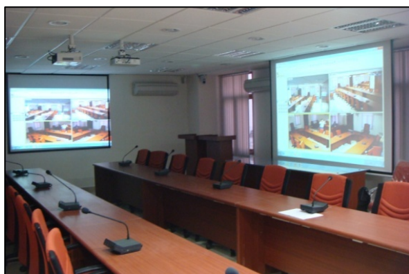
Multipurpose video Conferencing facility at Indian Red Cross Society national headquarters.

In 2011, the focus is on strengthening IT infrastructure of the DM programme state branches and also building the capacity of the state and district branches volunteers and staff through various training programmes. The stress is being given on overcoming the digital divide between IFRC and IRCS.