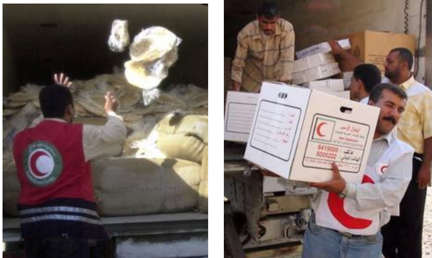
Loading the IRCS trucks for Falluja

A second convoy composed of seven vehicles, including four trucks and three ambulances, traveled to Al-Falluja city at 1030 hrs on Saturday 13 November led by the secretary general of the IRCS, with a number of its staff and volunteers, to carry relief items for 700 families. However, access to any remaining civilian population within the city was not permitted by the military.