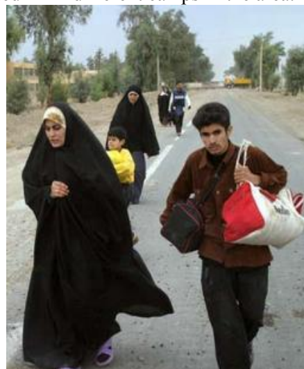
Families moving away from the city