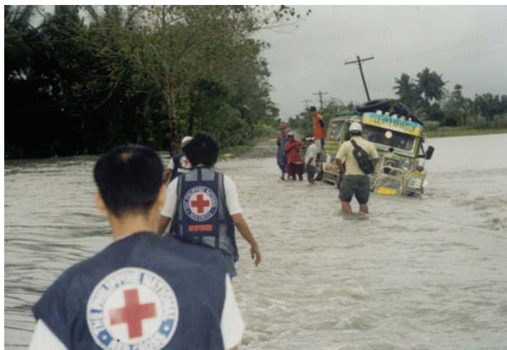
Dedicated team members from PNRRC traverse a road so flooded that it has trapped vehicles.

Severe monsoon rains have affected the provinces of Mindoro Oriental, Isabela (capital city Ilagan) and Palawan. Ensuing floods and landslides have killed five people and injured three to date. Mindoro Oriental has been the worst hit, with 14,247 families or 85,446 people affected in one city (Calapan city) and four towns. In Isabela and Palawan, 27 barangays (villages) in eight municipalities have been inundated, and recent floods have increased the number of affected to 633 families or 3,978 people. Barangay Fugu in Ilagan remains isolated, while barangay Lalod in Calapan City is still underwater because the area is surrounded by low-lying farm fields. Many other barangays in Palawan are inaccessible because of high water levels. Minor cases of common medical emergencies such as diarrhoea, colds, coughs and fever are being reported in the town of Aborlan, Palawan.