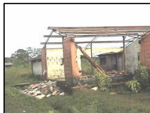
School in Bajo Baudo that was damaged by the earthquake

Damage and needs assessments were carried out in 70 communities in Choco and Valle del Cauca with the support of a disaster management delegate from the Federation's Pan American Disaster Response Unit. It was determined that the Colombian Red Cross Society would cover the basic needs of the affected population through the purchase, transportation and delivery of food packages and complete tool kits to support house repair and rebuilding. In the days following the earthquake, the Colombian Department of Disaster Preparedness and Response provided funding from the National Disaster Fund for the purchase of 2,020 food packages, 1,010 hygiene kits, 1,010 kitchen kits and 1,010 tool kits for 1,010 families in Choco. These funds were channeled through the National Disaster Preparedness and Response System, which includes the CRCS. Based on this initiative it was agreed that the CRCS would support the housing repairs by completing the tool kits with other necessary tools such as set squares, machetes, shovels and power saws. Other duties of the CRCS included providing logistics assistance to enable the operation to reach 58 communities of Choco. The CRCS also transported 70 additional food packages and kitchen kits from Cali to Buenaventura in Valle del Cauca to attend 70 affected families in that department.