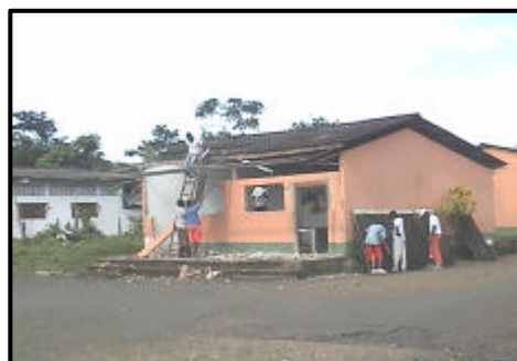
One of the main focuses of the CRCS relief operation was repairing homes damaged by the earthquake.