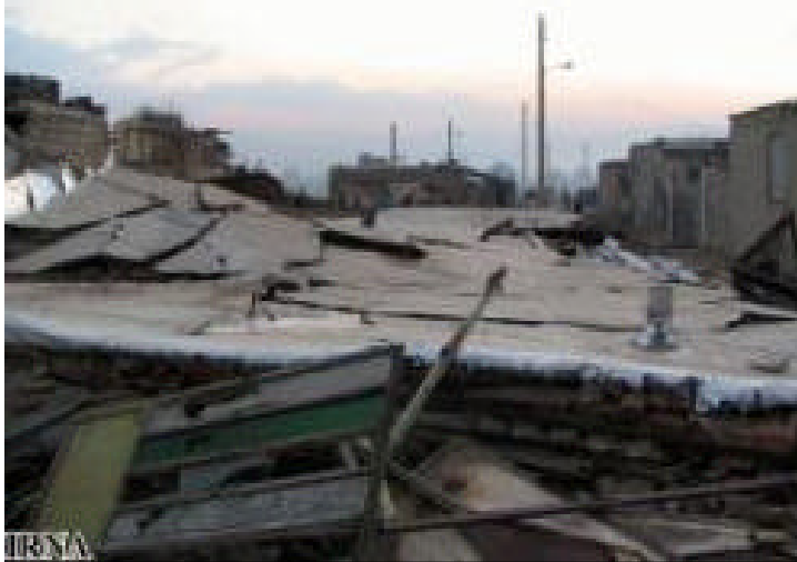
The earthquake caused tremendous damage in many provinces south-west of Tehran

Three strong earthquakes, ranging between 4.7 to 6 degrees on the Richter scale, occurred at 23:15 local time (07:45 GMT) and again at 04:50 (01:20 GMT) on Thursday. The epicentre of the second quake with a magnitude of six degrees on the Richter scale was registered in Chalanchovan in Doroud city of Lorestan province, 210 miles south-west of Tehran.