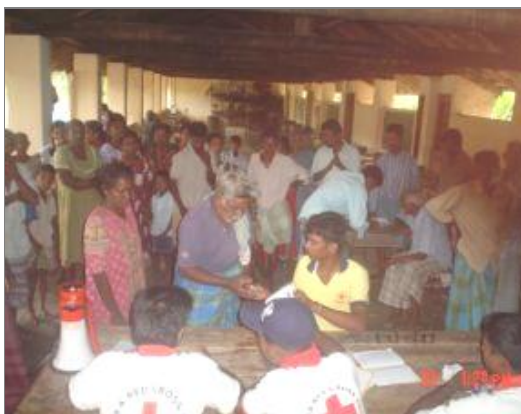
Sri Lanka Red Cross volunteers distributing dry rations and non-food relief items to IDPs in Trincomalee District

The Sri Lanka Red Cross Society (SLRCS) branch in Trincomalee has been working in cooperation with the Federation and the International Committee of the Red Cross (ICRC) to provide assistance to the displaced. Dry rations and non-food relief items in the form of hygiene and kitchen kits, tents, clothing and jerry cans for water collection have been distributed and first aid and health services have been provided to IDP populations. Similar distributions and assistance is being provided to people who have moved to other districts following the recent displacement in Trincomalee.