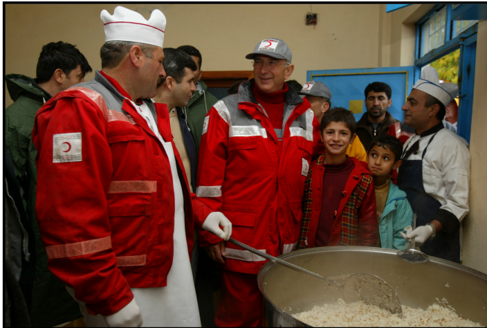
The Red Crescent is providing hot food to the affected of the floods. One of the hot meal distribution centres in the camps.

In Suruc the updated distribution figures are: 110 tents, 1,800 blankets, two mobile kitchens, 700 food packages, 400 beds, 125 kitchen sets, 864 bottled water (0.5 lt.) and 690 jerry cans have been sent to the county. Turkish RCS regional and local centres are dispatching food items to the county and relief team is pitching tents.