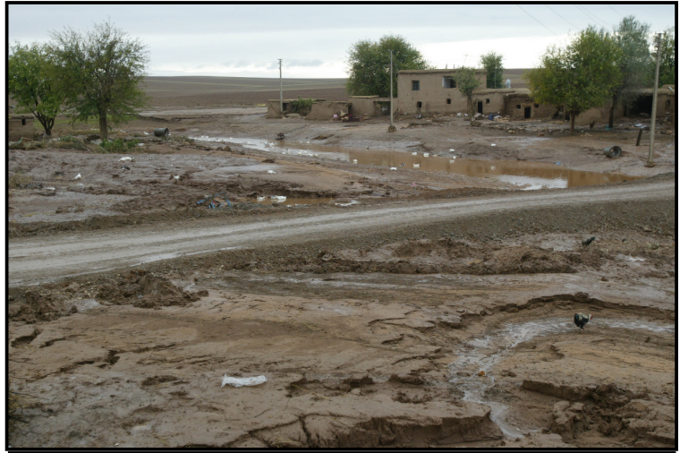
An affected area in Bizmil district in Diyarbakir.

The Turkish Red Crescent Society (Turkish RCS) Disaster Operation Centre (DOC) immediately alerted its Regional Disaster Response and Logistics Centres located in Erzurum and Elazig provinces, the Local Disaster Response & Logistics Centre (LDRLC) in Mus province and the branches and blood centres in the eastern provinces. DOC established a crisis centre to coordinate the response activities with its components in the field.