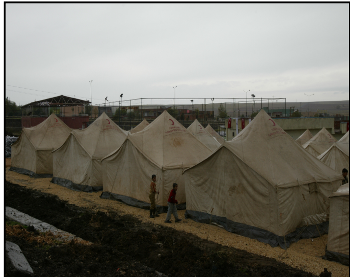
The camp set up by Turkish Red Crescent in Bizmil district of Diyarbekir province.

Federation Regional Delegation in Ankara is monitoring the situation and is in touch with Turkish RCS DOC. To date, a total of 105 Red Crescent personnel (nine relief teams) and 17 vehicles have been deployed from various centres and branches to the affected regions. Turkish RCS has sent relief materials to the affected areas of the country at an estimated cost of USD 3 million.