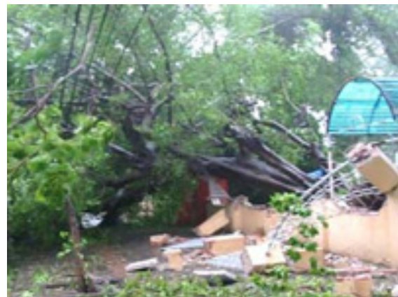
Collapsed trees destroyed many houses