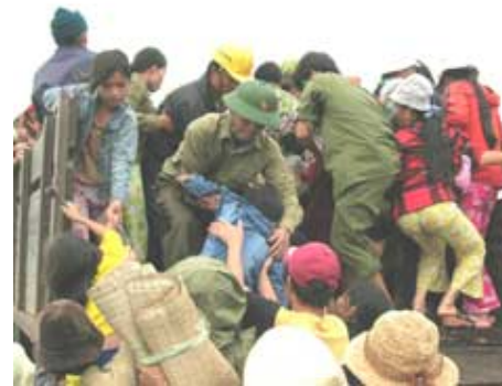
People are evacuated before the typhoon