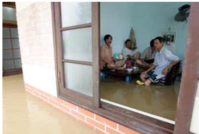
Flooding has spread to many areas