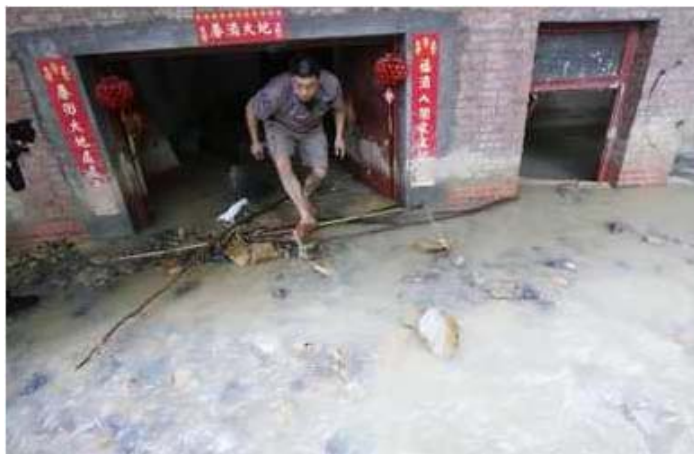
A man walks out from his house after a landslide triggered by heavy rains hit the district in Chongqing.

The rain has affected about 16.7 million people and caused the evacuation of some 555,000 people in Jiangsu, Anhui, Henan, Hubei, Sichuan, Chongqing and Shaanxi provinces. More than 49,000 houses have collapsed and an estimated 240,000 damaged as a result of torrential rains which began lashing Huaihe River valley, east area of Sichuan Province and south area of Shaanxi Province. Heavy rains have also triggered mountain torrents, water loggings, land and mudslides.