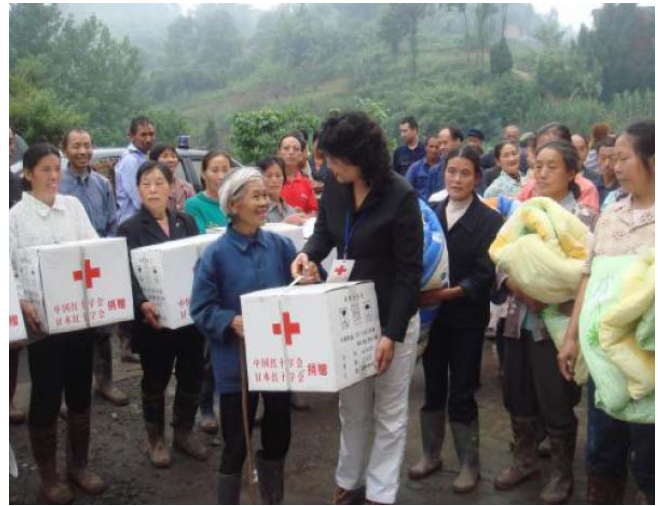
RCSC Sichuan branch volunteers distributing family packs to those affected by the floods.

Needs assessments are ongoing in the affected provinces while RCSC headquarters and the Federation's East Asia office continue to monitor the situation very closely.