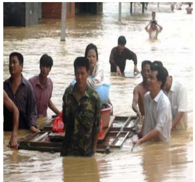
A pregnant woman being assisted while evacuating flooded areas in Longwo Town, Zijin County of south China's Guangdong Province.

Following severe drought in areas of Southwest China's Sichuan province, experts were warning of possible flooding along the Yangtze River. On Friday, Sichuan province reported seven deaths and nine injuries in Liangshan autonomous prefecture of the Yi nationality. Continuous rainfall on Wednesday and Thursday brought hailstorms, lightning strikes and landslides. Rainstorms also hit central Hunan province from Wednesday night through Thursday, leaving three people dead, one missing and 158,000 homeless. Initial assessments reports Zijin County, of Guangdong province, as being hit by the worst flooding in 50 years.