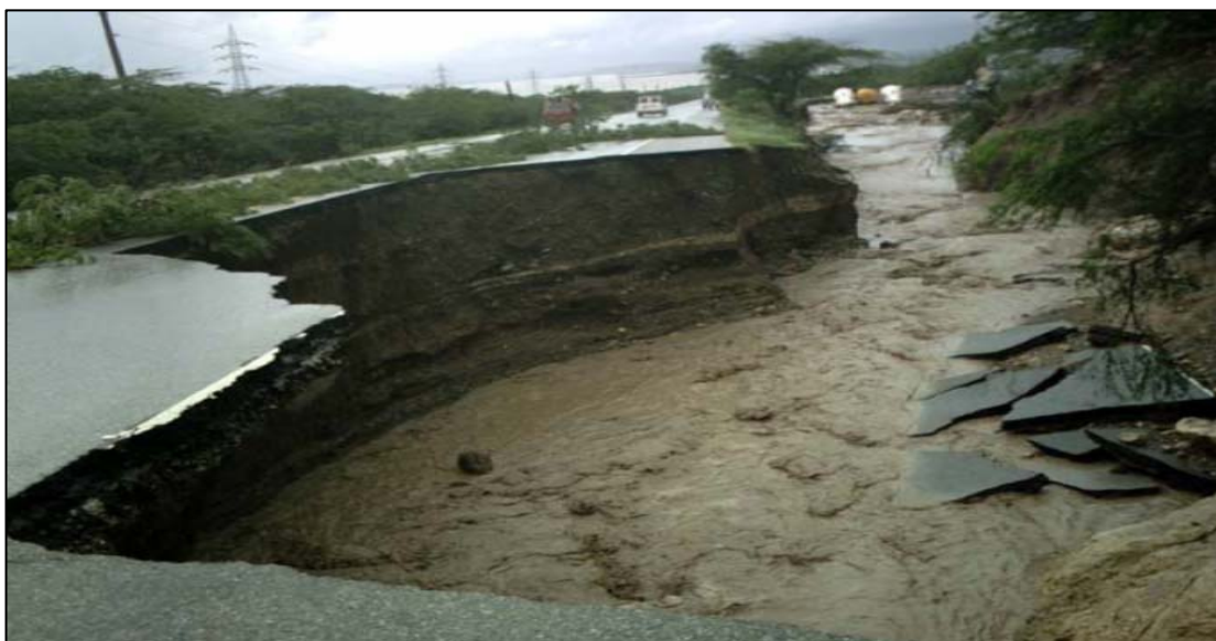
Infrastructural damage caused by floods in the province of Azua in Dominican Republic.

The Bahamas Red Cross Society and the Cuban Red Cross remain on alert and monitoring the situation.