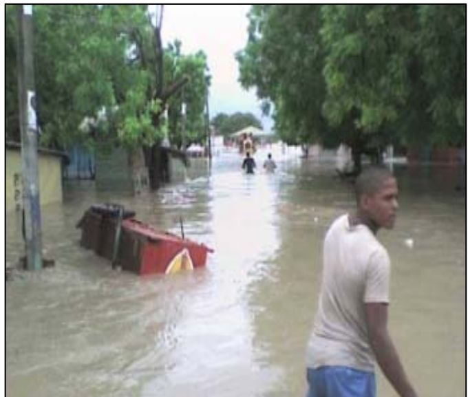
Floods in the province of Azua in the Dominican Republic.

The Coordination Centre is in permanent alert and a crisis room has been set up with personnel working 24 hour shifts. Approximately 500 volunteers have been alerted and the DRC branches are working in close coordination with the local authorities and with the Pan American Disaster Relief Unit (PADRU).