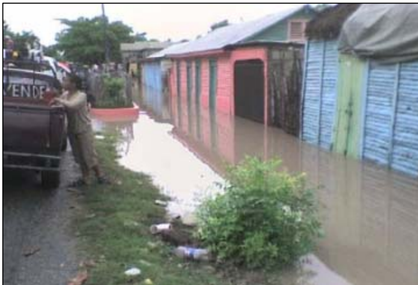
Floods in the province of Azua in Dominican Republic.

Floods have been reported in several communities in the island and emergency calls were received from several regions. The National Emergency Commission (Comisión Nacional de Emergencias – CNE) has authorized the activation of several shelters. At least 20 people have died; 33 people are missing and serious damages to houses and infrastructure has been inflicted. The country's electricity is down, paralyzing airports, schools and businesses in the northern and southern regions. Reports indicate that 95 percent of plantain, banana and tomato plantations