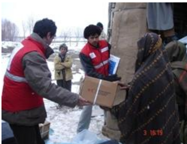
Relief items donated by ECHO, through the Federation, being distributed by ARCS volunteers to affected people in Balkh province, northern Afghanistan

The assessments and response operation by the Afghan Red Crescent Society (ARCS) continued in affected areas of the country during this reporting period. Updated information was regularly provided by the ARCS branches in the affected areas, the International Committee of the Red Cross (ICRC) sub-delegations and the Afghan National Disaster Management Authority (ANDMA). Updated information from the field will be posted on the Federation's Disaster Management Information System (DMIS), as and when received.