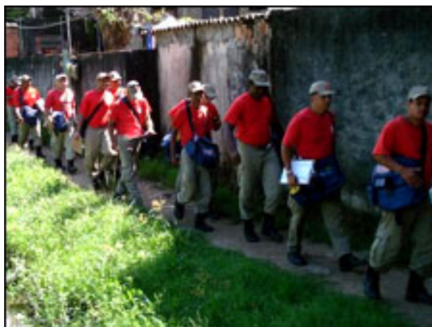
Firemen are working in the favela of Coroado treating stagnant water.

<click here for contact details, or here to view the map of the affected area>