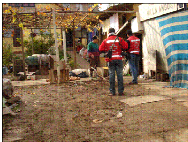
The CRC performing damage and needs assessments.

From the onset of the emergency, the International Federation, through the Pan American Disaster Response Unit (PADRU) and the Regional Representation for South America, has been closely monitoring the events and is coordinating all response activities with the Chilean Red Cross (CRC).