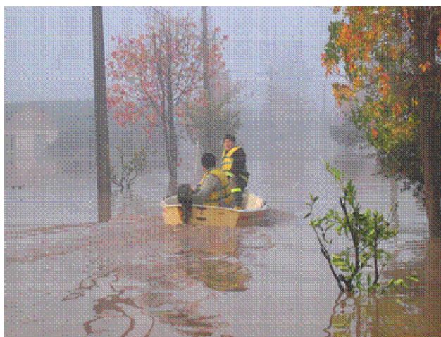
Floods in the area of Lincantén.

<click here for the map, or here for contact details>